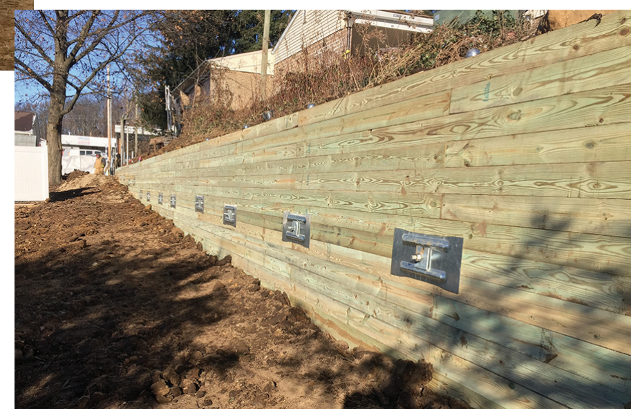
Completed Wall Supported by ECP Helical Screw Piling and Tiebacks.

The project took about a month to comeplete.