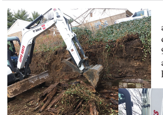
Demolition of Existing Failing Railroad-tie Wall.

Each of the downhill properties had fences between them and no access from the street. The uphill property had a major underground electrical line near the retaining wall so excavation behind the wall would not be possible. The solution and plans provided by Midwest Foundation Tech was to build a retaining wall using vertical helical screw piles (as soldier piles) with helical screw tiebacks and pressure treated 4x6 lumber. The piles and tiebacks would be placed nominally at 8' on center except for the 9' wall, where the span was reduced to 6' and an additional layer of tiebacks were added.