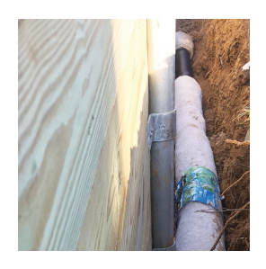
Support Clamps and Easy Flow Drain

The plan called for ECP 2-7/8" O.D., Schedule 80, helical screw piles. The vertical piles were typically a 10" x5' lead and a 10' extension. The tiebacks were 1-1/2" square shaft and consisted of an 8"x10"x5' lead, extensions, a TAT-150 transition to a 1" diameter tierod, and